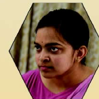
YERRAMSETTI USL RAMANI AIR - 583