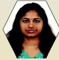
CHALLA KALYANI AIR - 285