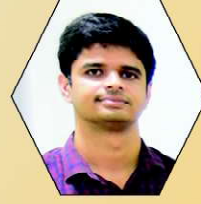
PATHIPAKA SAI KIRAN AIR - 460