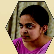
YERRAMSETTI USL RAMANI AIR - 583