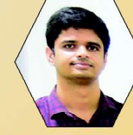
PATHIPAKA SAI KIRAN AIR - 460